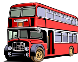
More mass, more inertia

Inertia is the property of an object that resists change of motion.